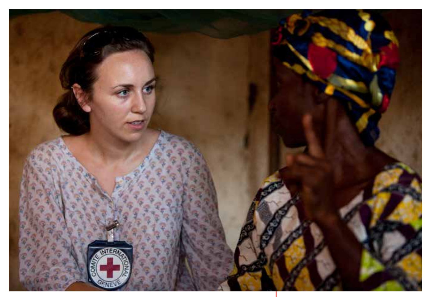
Photo: Bangui, Bimbo women's prison. An ICRC delegate talks to a detainee

As a testament to the accepted nature of these laws, all countries have ratified the Geneva Conventions, and the vast majority are parties to the 1977 Additional Protocols.