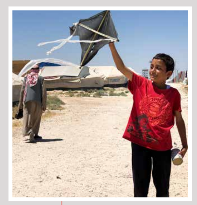
Photo: North East Syria, Al Hassakeh Governorate, Al Hol camp for internally displaced persons

The sick and wounded must be cared for humanely and without distinction. Medical personnel, hospitals and ambulances must never be targeted. They must be respected and protected. The distinctive red cross, red crescent and red crystal emblems and other officially-recognised symbols indicate that the building displaying the emblem, or the person wearing it, must not be attacked.