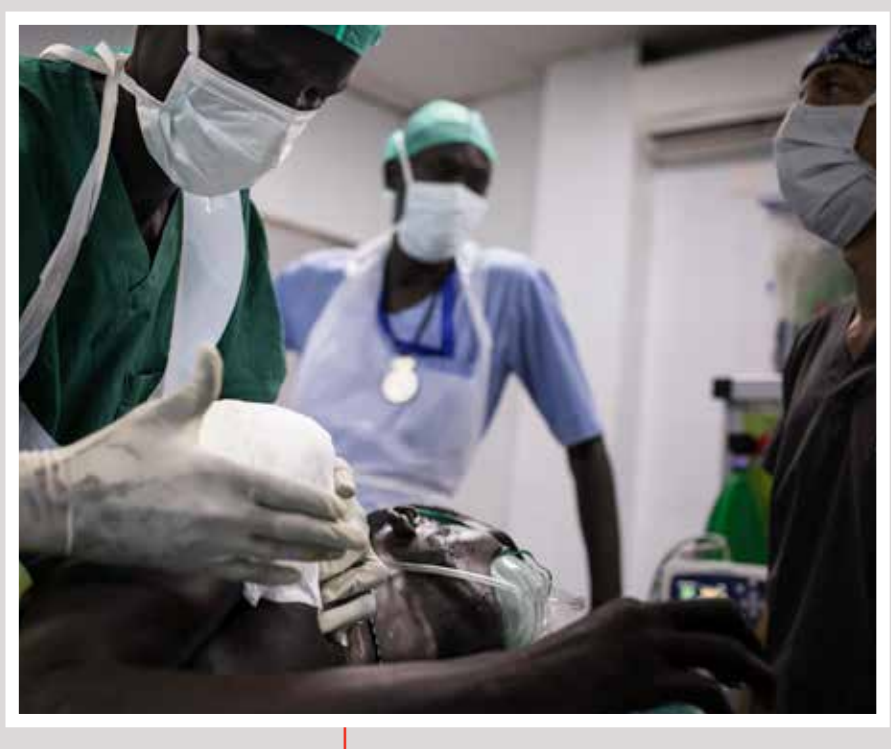
Photo: A patient with a firearm injury undergoes surgery in this hospital supported by the ICRC