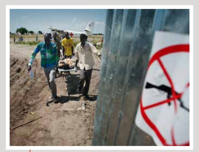
Photo: A war-wounded patient has been taken out of an ICRC-plane after been evacuated by a medical team

Military force is not an end in itself – the only legitimate military purpose in an armed conflict is to weaken the military capacity of the other parties to the conflict. Parties do not have unfettered access to war tactics and weapons. Only means and methods that are necessary to accomplish a legitimate military purpose, and are not prohibited by IHL, are permitted.