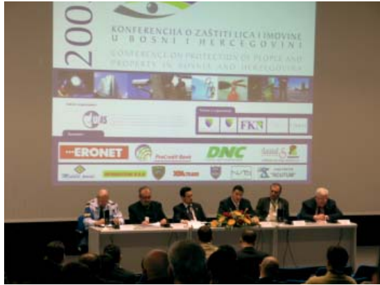
'Conference about the protection of person and property in BiH' 20 December 2005

elsewhere. In too many cases companies were found to have inappropriate affiliations (for example with political parties or criminal groups), to employ untrained staff, or to engage in bad practice. Formal regulation of the sector was also found to diverge widely: although most countries in the region now have specific legislation to regulate the industry, problems with the effective implementation of these laws and with the broader oversight of the sector were numerous. In those cases where companies had chosen to self-regulate by forming trade associations and agreeing codes of conduct this was seen to have helped in raising standards. For their part client organisations could probably do more: the limited amount of information available on the procurement practices of commercial and public sector clients suggested that contracts are often awarded on an informal basis, or on grounds of cost alone.