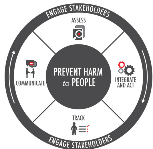
Figure 1: Human rights due diligence