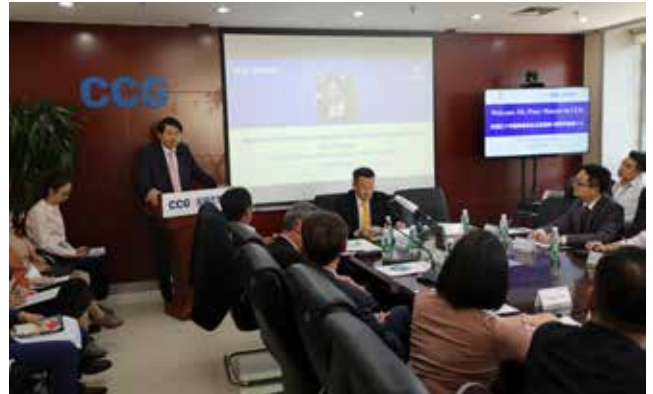
ICRC President, Peter Maurer, addresses representatives of Chinese business community

Moreover, business activities may be considered ‘closely linked to an armed conflict’ even if they do not take place during actual fighting or on the physical battlefield and even if the business did not actually intend to support a party to the hostilities. Given the difficulty in determining which business activities are or are not ‘closely linked to an armed conflict’, prudent corporate risk management would suggest a cautious