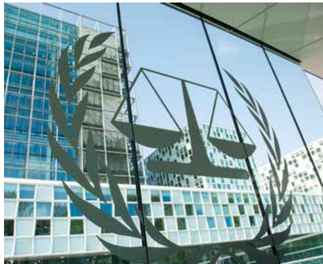
Photo: Permanent Premises of the International Criminal Court.

In Australia, for example, persons or companies suspected of committing war crimes can be tried under the Criminal Code Act 1995 (Cth). They can be