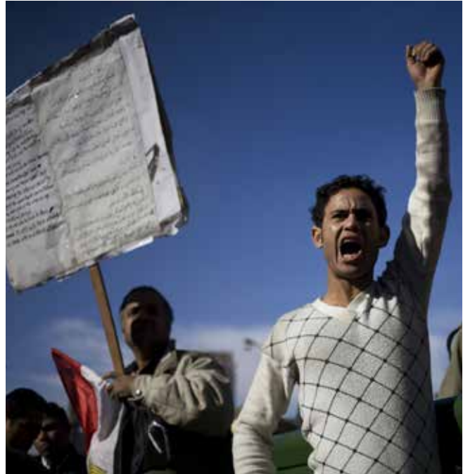
Photo: Protestors, Tahrir Square

A business that claims to observe best practice in respecting human rights should understand when and where the rules and principles of IHL apply, not only when conducting operations in a conflict zone, but also to sufficiently prepare yourself should the environment change.