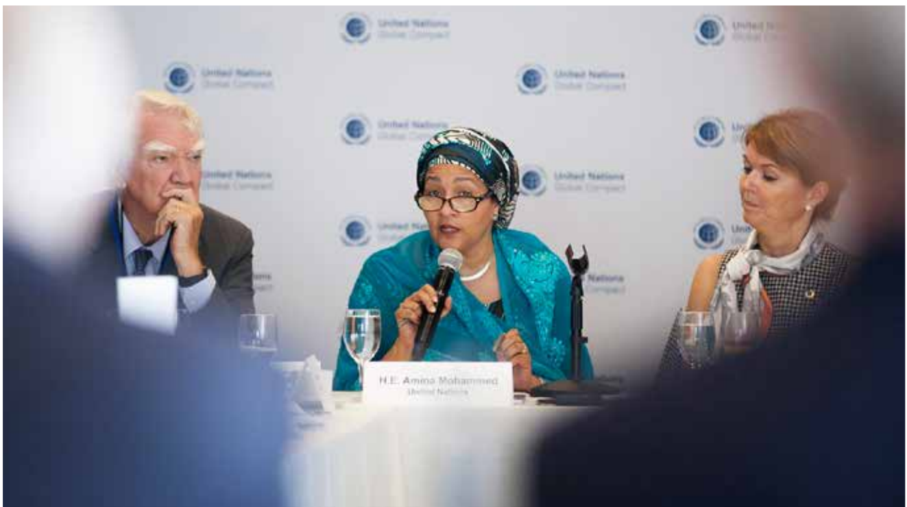
Photo: Inaugural CEO Roundtable Organized by UN Global Compact

A number of major global, multi-stakeholder initiatives that deal with business and human rights issues also call on companies in conflict zones to abide by IHL. Because of this, your business's existing human rights policies and commitments, for example on risk management and training, may already include requirements to respect and adhere to IHL.